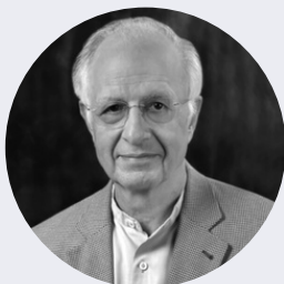
Shri. Arun Maira

Former Minister of State (Independent Charge), Government of India